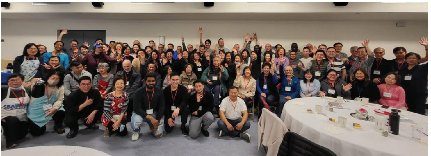
A photo from the final day of our Alpha Spring 2023 season, hosting 68 guests! Thank you Alpha participants and volunteers. Let us continue to invite and pray for all who have yet to seek out Christ!