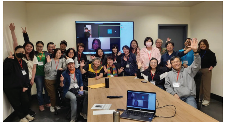
Spring of 2023, we started our first Alpha hosted in Chinese!

I took that literal leap of faith. And amazing things happened. Solutions to our Wednesday night challenges became available to us.